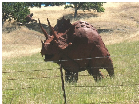
This guy looks pretty scary standing by the side of the road.

On June 5th the Tailwinds met at the Gazebo in Arroyo Grande for a 36 mile ride to Huasna Township and back to Arroyo Grande. The ride included a view of the Dinosaurs. The temperature reached 103 but the riders stuck it out and everyone had a good time. After the ride the group stopped for a beer, iced tea or lots of water and a little lunch before heading for home. Meet at the Gazebo in Arroyo Grande 9:00. 31 miles