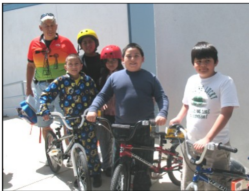
The happy winners with their new bikes and helmets